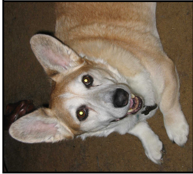
Cardigan Welsh Corgi National Rescue Trust A Not-for-Profit 501(c)3 Organization